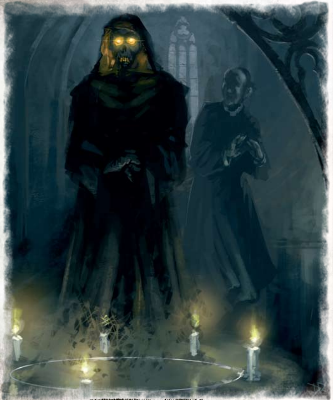
THE BLACK JUDGE